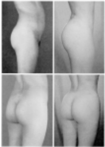
Fig. 3. A 25-year-old woman shown before ( left ) and 2 years after surgery ( right ). She had liposuction in the lumbosacral region and lipoinjection of 230 cc. This patient had a long-term follow-up, which shows that the results of the gluteal region improvement were maintained.