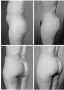
Fig. 2. A 42-year-old woman shown 14 months after surgery ( right ). The patient presented preoperatively with inadequate superior gluteal shape because of fat excess in the lumbosacral region ( left ). Improvement of the superior gluteal contour occurred with the lipoinjection of 120 cc and lumbosacral liposuction. The inferior contour improved after subgluteal liposuction. An abdominoplasty was performed at the same time.